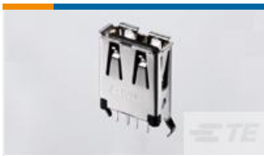
TE Part #1734366-2 Std USB Type A, VT, T/H, White