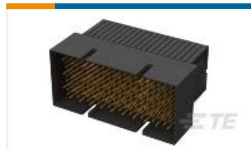
TE Part #2102319-1 Fortis Zd 20 Col R/A Full Shroud Assy SE