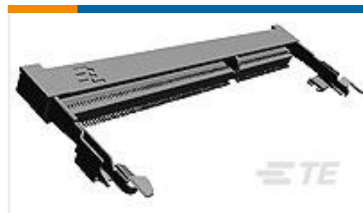
TE Part #2013290-1 SEMI-HARD TRAY DDR3 204P 5.2H RVS