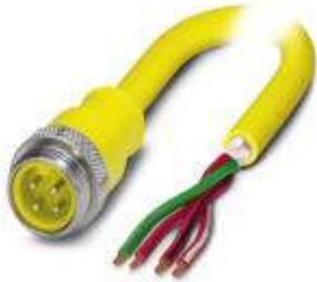
Sensor/Actuator cable, 4-position, PVC, Yellow RAL 1021, Plug straight 7/8"-16UNF, A-coded, on Free cable end, Cable length: 2 m

Please be informed that the data shown in this PDF Document is generated from our Online Catalog. Please find the complete data in the user's documentation. Our General Terms of Use for Downloads are valid ( http://download.phoenixcontact.com )