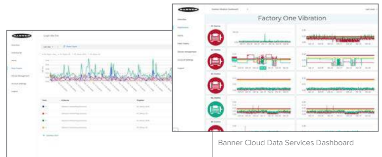
Banner Cloud Data Services Dashboard