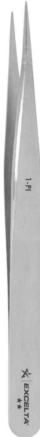
Critical Tip Measurements (Tip Width and Thickness of one point)