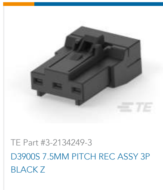
TE Part #3-2134249-3 D3900S 7.5MM PITCH REC ASSY 3P BLACK Z