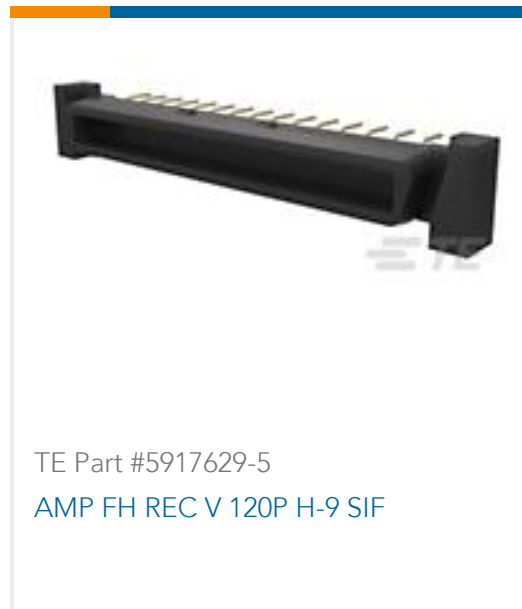
TE Part #5917629-5 AMP FH REC V 120P H-9 SIF