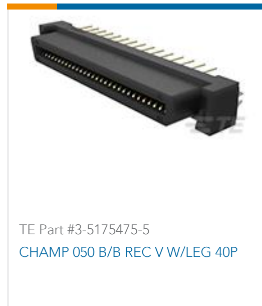
TE Part #3-5175475-5 CHAMP 050 B/B REC V W/LEG 40P