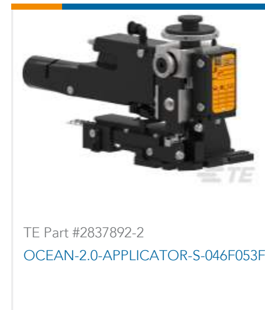
TE Part #2837892-2 OCEAN-2.0-APPLICATOR-S-046F053F