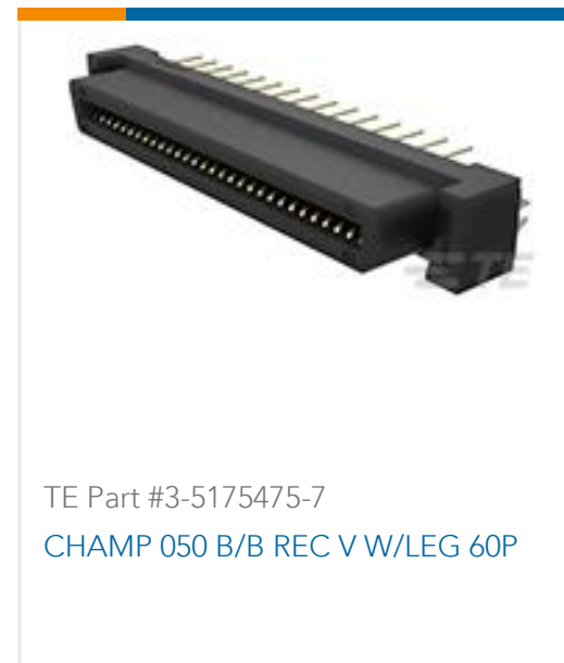
TE Part #3-5175475-7 CHAMP 050 B/B REC V W/LEG 60P