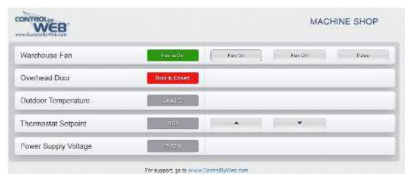
Example Control Page