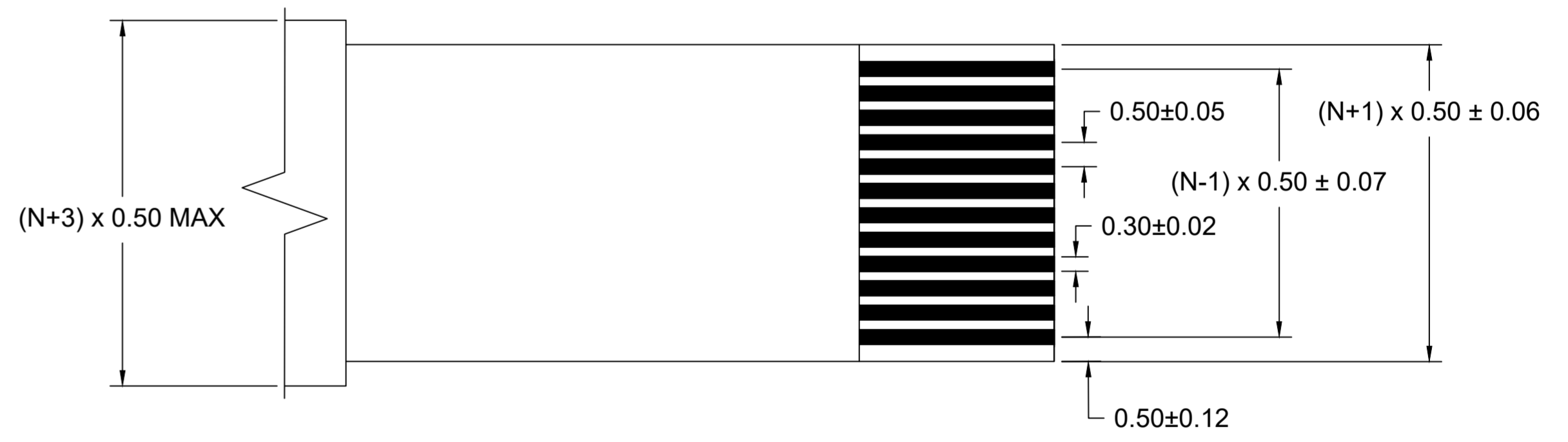
END-TAIL DIMENSIONS SCALE 10:1