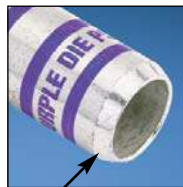
Corona Relief Taper