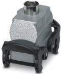
HEAVYCON B10 coupling housing, with double locking latch, height: 62 mm, with 1 x Pg16 gland, straight cable outlet

Please be informed that the data shown in this PDF Document is generated from our Online Catalog. Please find the complete data in the user's documentation. Our General Terms of Use for Downloads are valid ( http://phoenixcontact.com/download )