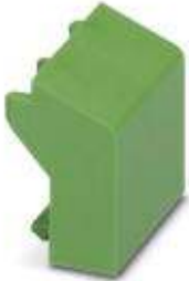
Filler plugs, for unoccupied terminal points

Please be informed that the data shown in this PDF Document is generated from our Online Catalog. Please find the complete data in the user's documentation. Our General Terms of Use for Downloads are valid ( http://phoenixcontact.com/download )