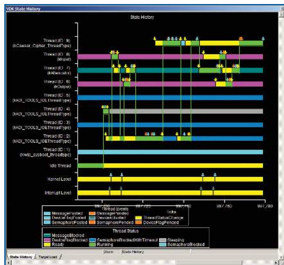
Kernel event history.

For Blackfin Processors and SHARC Processors, inspection, or even