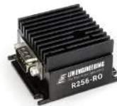
Single Axis Controller + Driver R256-RO