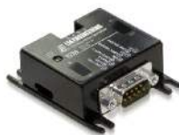
Microstepping Driver R208