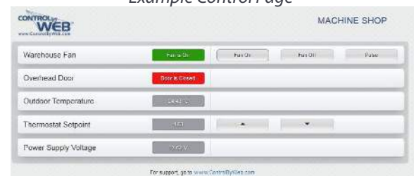
Example Control Page