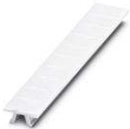
Zack marker strip, 10-section, vertically labeled with the consecutive numbers: 11 ... 20, white, width: 6 mm

Please be informed that the data shown in this PDF Document is generated from our Online Catalog. Please find the complete data in the user's documentation. Our General Terms of Use for Downloads are valid ( http://phoenixcontact.com/download )