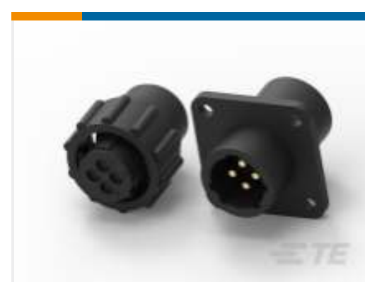
TE Part # CAT-AM71-C83998J Cable/Panel Mount Connector, CPC Series 1