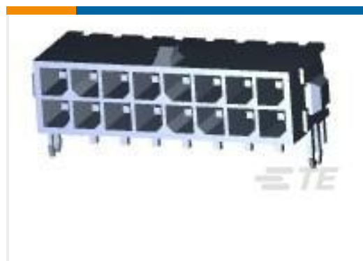
TE Part #4-794678-6 16P MICRO MNL ASSY,R/A,THRU,LF