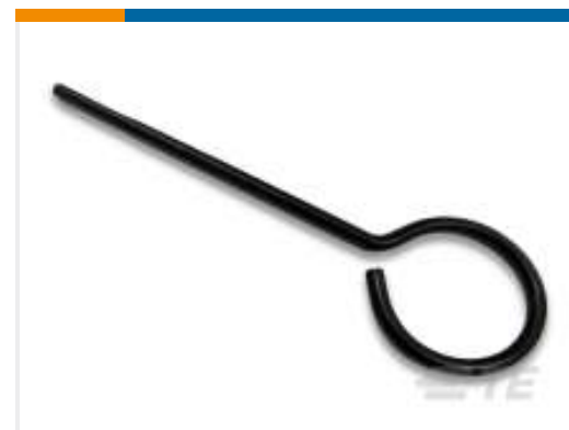
TE Part # 200893-2 INSERTION TOOL CONT