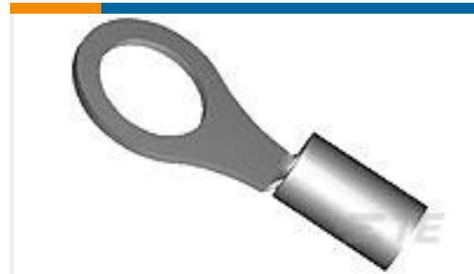
TE Part #322329 TERMINAL,SOLIS R HT 16-14 6