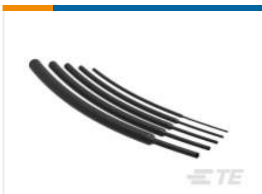
TE Part #NB18434001 RNF-100-4-BK-SP