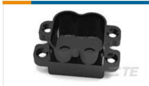
TE Part #1648548-1 295-0040-01100