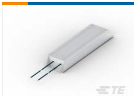
TE Part #2176464-7 HCH215 300W 82R 5% LEAD