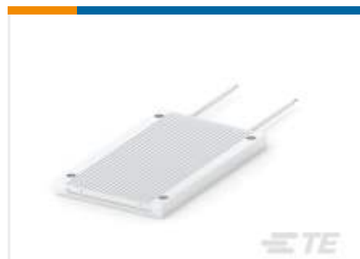
TE Part #1-2176250-1 TJT 500W 47R 5%