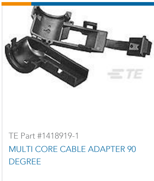
TE Part #1418919-1 MULTI CORE CABLE ADAPTER 90 DEGREE