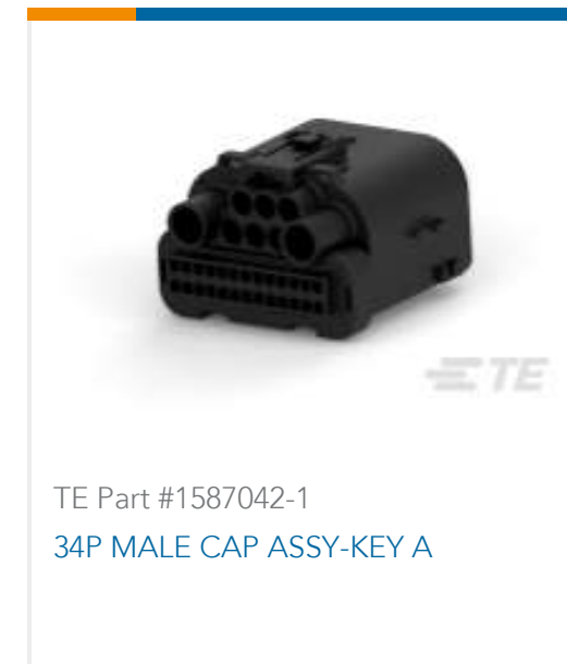
TE Part #1587042-1 34P MALE CAP ASSY-KEY A