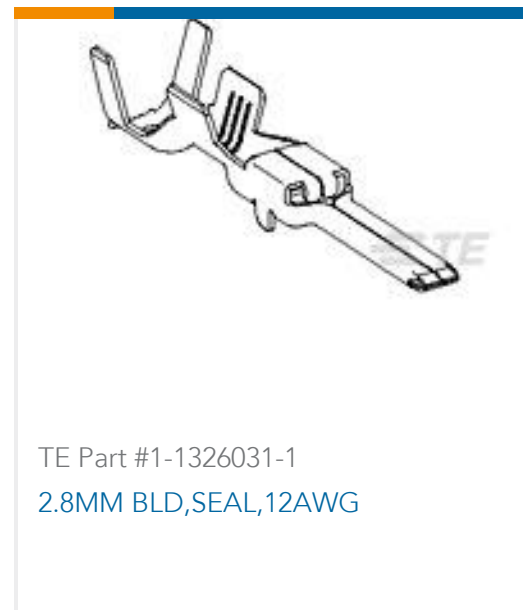
TE Part #1-1326031-1 2.8MM BLD,SEAL,12AWG