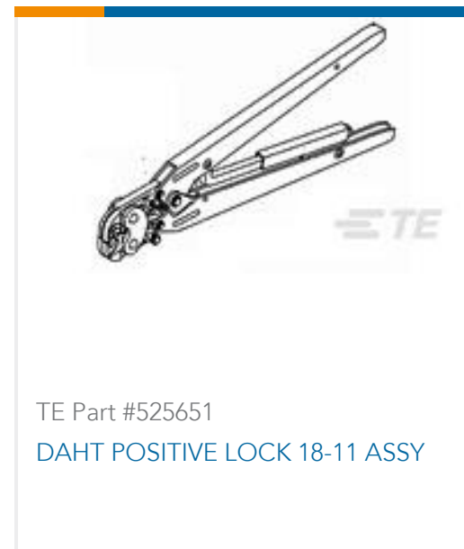
TE Part #525651 DAHT POSITIVE LOCK 18-11 ASSY