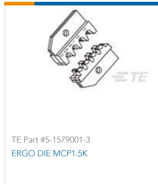
TE Part #5-1579001-3 ERGO DIE MCP1.5K