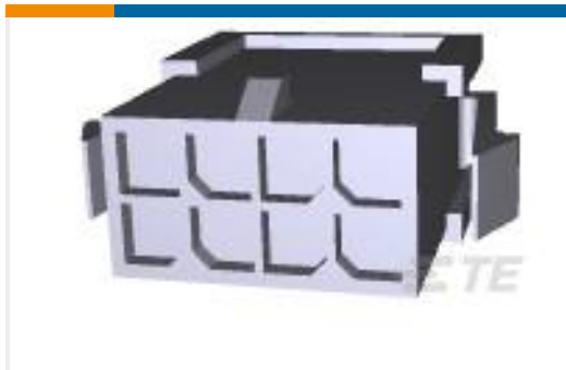
TE Part #794615-8 PANEL MT DBL ROW HSG 8 POS