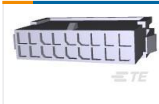
TE Part #1-794615-8 PANEL MT DBL ROW HSG 18 POS