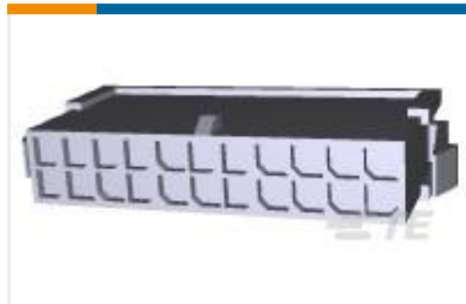
TE Part #2-794615-2 PANEL MT DBL ROW HSG 22 POS