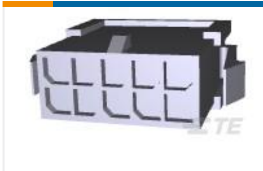
TE Part #1-794615-0 PANEL MT DBL ROW HSG 10 POS