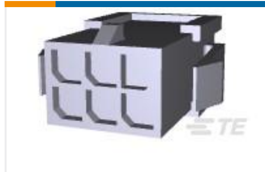
TE Part #794615-6 PANEL MT DBL ROW HSG 6 POS