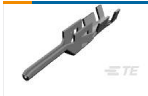
TE Part #1-794612-1 PIN CONT 20-24 15 GOLD L/P