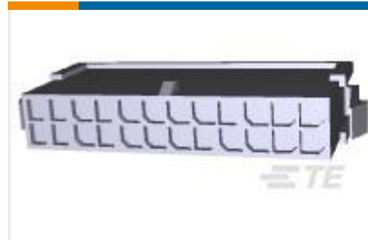
TE Part #2-794615-4 PANEL MT DBL ROW HSG 24 POS