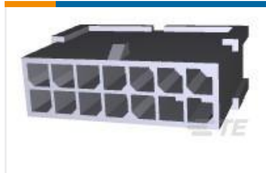
TE Part #1-794616-4 FREE HANG DBL ROW HSG 14 POS