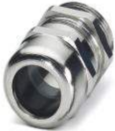
Cable gland, Cable gland material: Brass, nickel-plated, External cable diameter 13 mm ... 18 mm, Shielding: No, Connecting thread: 3/4 inch NPT, Color: silver

Please be informed that the data shown in this PDF Document is generated from our Online Catalog. Please find the complete data in the user's documentation. Our General Terms of Use for Downloads are valid ( http://phoenixcontact.com/download )