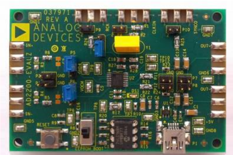
Figure 1. ADA2200-EVALZ Evaluation Board

The ADA2200-EVALZ is the simpler of the two evaluation boards. It facilitates signal connections to standard test equipment. The part can be reconfigured with the use of the on-board EEPROM.