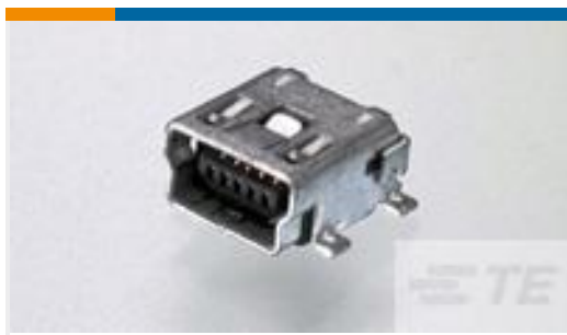
TE Part #1-1734035-1 MINI USB, TYPE B, R/A, SMT