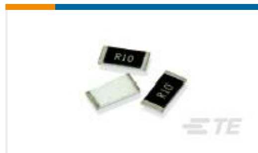
TE Part #1-2176057-4 RLP73M 3A R036 1% 1K RL