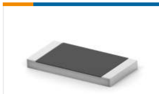
TE Part #3-1622820-1 SMD Power Resistor: 1 Watt, 3520 Series