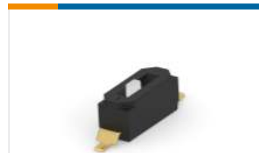
TE Part #2-2319847-2 END STACK DIP 1P G RAISED T&R