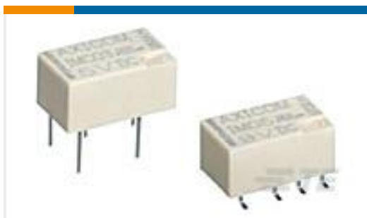
TE Part #1462042-9 IMC06CGR=IM Relay 140mW 12V 1CO