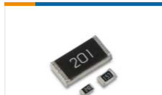
TE Part #2-2176330-9 CRGP 2010 2K2 1%