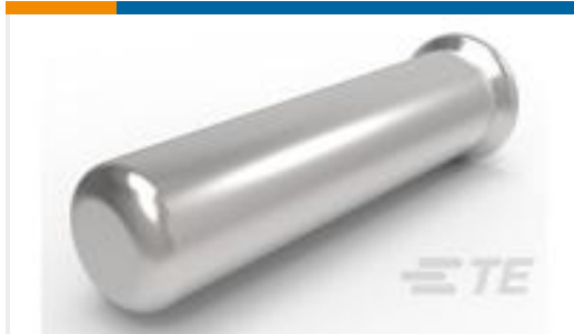
TE Part #147444-1 SOCKET,MIN-SPR AU-AU SER-1