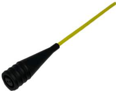
CMCP602HST Push On IP68 Connector