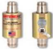
Lightning Arrestor (LABH350NN)