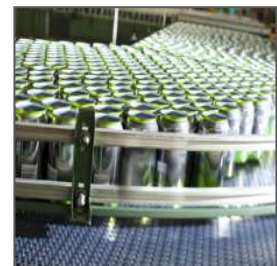
Material Handling and Bottling