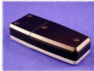
click to enlarge Assembled View (Bottom)