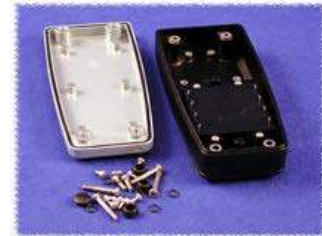
click to enlarge Open View (Top)