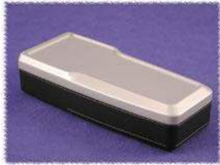
click to enlarge (Assembled View)

Path: Home > Enclosure Index > MOREnclosures > ROLEC - Sealed - Diecast Aluminum HandCase