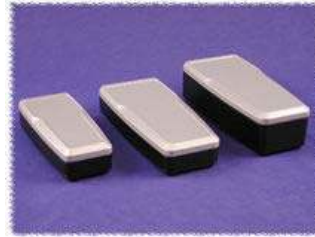
click to enlarge (Group View)