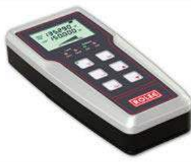
click to enlarge (Application Example)