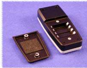
click to enlarge Open View (Bottom)