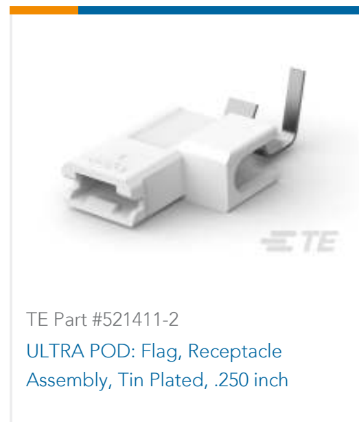
TE Part #521411-2 ULTRA POD: Flag, Receptacle Assembly, Tin Plated, .250 inch