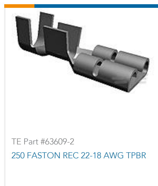
TE Part #63609-2 250 FASTON REC 22-18 AWG TPBR