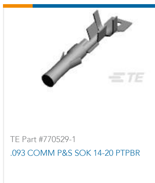
TE Part #770529-1 .093 COMM P&S SOK 14-20 PTPBR