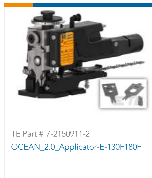
TE Part # 7-2150911-2 OCEAN_2.0_Applicator-E-130F180F