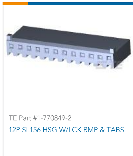
TE Part #1-770849-2 12P SL156 HSG W/LCK RMP & TABS