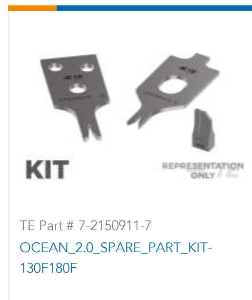
TE Part # 7-2150911-7 OCEAN_2.0_SPARE_PART_KIT-130F180F