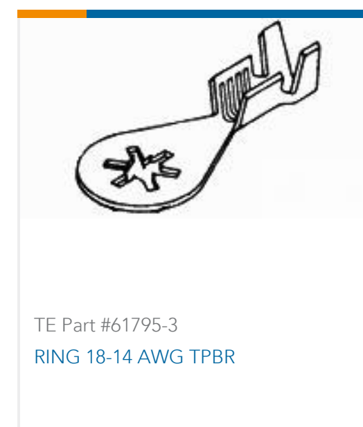
TE Part #61795-3 RING 18-14 AWG TPBR