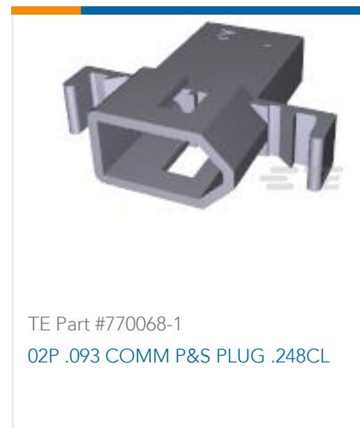
TE Part #770068-1 02P .093 COMM P&S PLUG .248CL