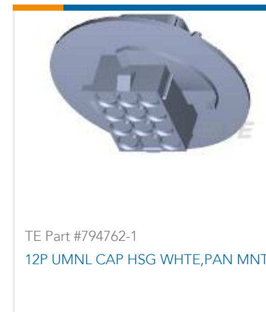
TE Part #794762-1 12P UMNL CAP HSG WHITE,PAN MNT