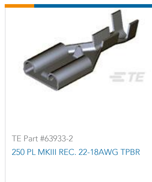
TE Part #63933-2 250 PL MKIII REC. 22-18AWG TPBR