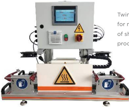
Twin workstation heater for multiple installation of short length tubing products