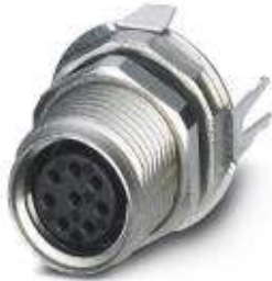
Sensor/actuator flush-type plug-in connector, socket, 8-pos. M8, rear/screw mounting with M10 fastening thread, with straight solder connection

Please be informed that the data shown in this PDF Document is generated from our Online Catalog. Please find the complete data in the user's documentation. Our General Terms of Use for Downloads are valid ( http://download.phoenixcontact.com )