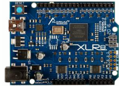
XLR8 Top View

For those who want to design their own FPGA logic, we offer OpenXLR8 - a platform for users to create custom Xcelerator Blocks. This allows developers proficient with Verilog or VHDL and Intel's Quartus Prime software to create their own XBs. The sky's the limit on what can be done, and the XBs created this way can be shared with the rest of the XLR8 community.