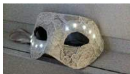
^ Project Example (requires extra LEDs)