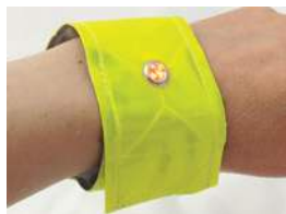
^ Project Example