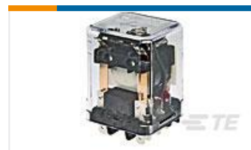
TE Part #8-1393113-8 KUEP-11D15-48=KU