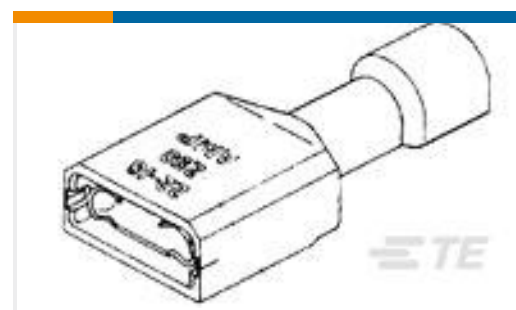
TE Part #2-520193-2 ULTRA-FAST 187 ASY REC 22-18 TPBR