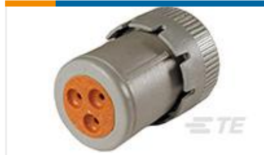
TE Part #HD16-3-16S PLUG ASM