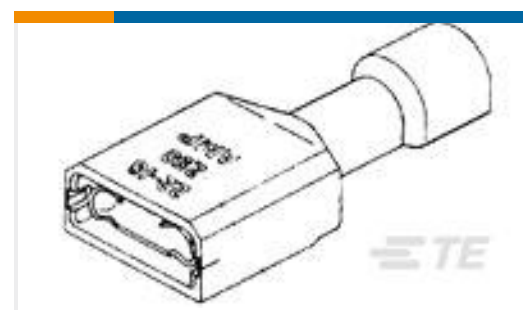
TE Part #3-520276-2 ULTRA-FAST 187 ASY REC 16-14 AWG TPBR