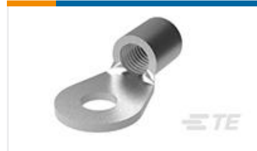
TE Part #36923 TERMINAL,SOLIS R 2/0 3/8