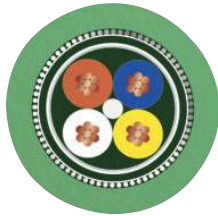
PROFINET drag chain CAT5e [93C]