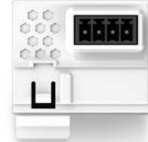
RS485 interface - White