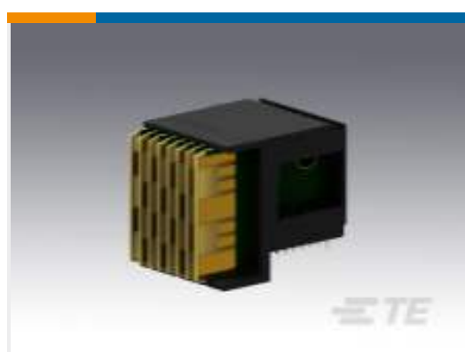
TE Part #1410971-4 MULTIGIG RT T2 7RW H-LFT RTM