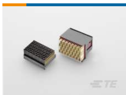
TE Part #2302785-2 RA PLUG ASSY, 7ROW, CENTER, VPX, MG RT3