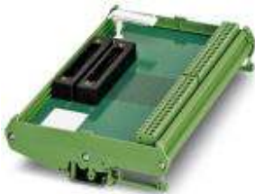
The figure shows version FLKM-2KS40/SPT/CS

Please be informed that the data shown in this PDF Document is generated from our Online Catalog. Please find the complete data in the user's documentation. Our General Terms of Use for Downloads are valid ( http://phoenixcontact.com/download )