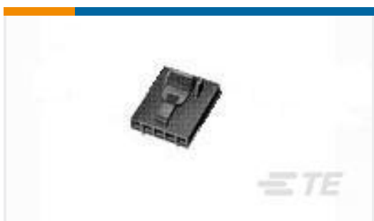
TE Part #104257-1 02 MTE RCPT HSG SR LATCH .100