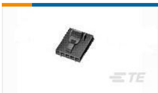
TE Part #104257-3 04 MTE RCPT HSG SR LATCH .100