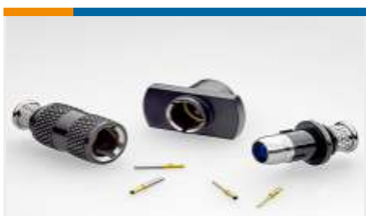
TE Part #2226913-2 CONTACT, PIN, CRIMPED, SIZE 23, GND