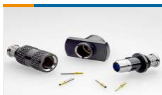
TE Part #2226923-1 CONTACT, SOCKET, HOODED, CRIMP, SIZE23