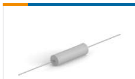
TE Part #5-2176414-3 7W STD M/OX 5% 3K0