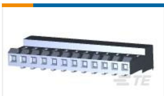
TE Part #4-640430-2 12P MTA156 CONN ASSY 26AWG BLU