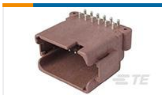
TE Part #DTF13-12PD HDR, 12P, BRN, RA, SN/NI/CU, D