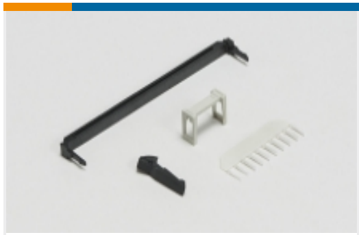
Ribbon Connector Accessories(1)