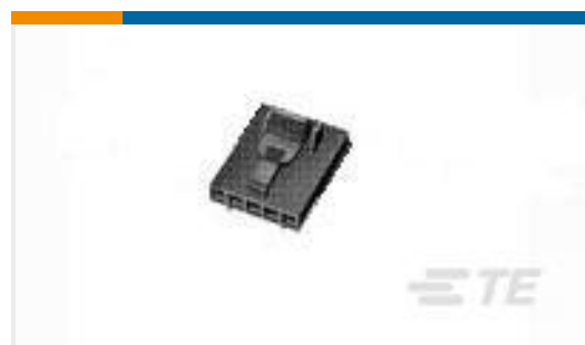
TE Part #104257-6 07 MTE RCPT HSG SR LATCH .100