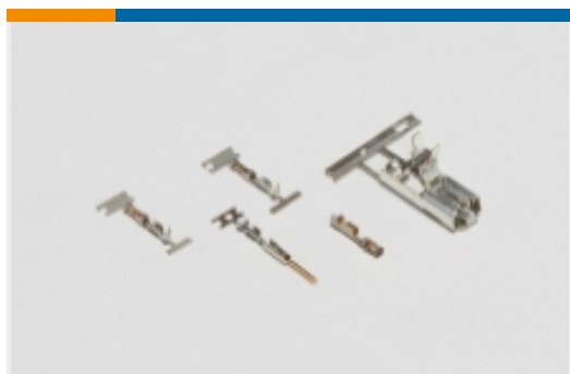
Wire-to-Board Connector Contacts(32)