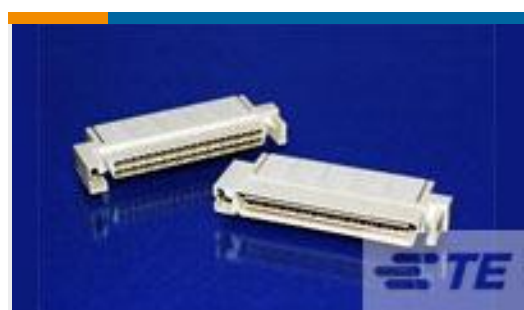
TE Part #6367580-4 ASSY Z-DOK+4 HOST BOARD 32PR