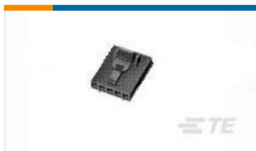
TE Part #104257-2 03 MTE RCPT HSG SR LATCH .100