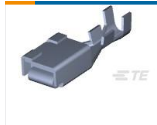
TE Part #1318986-6 DYNAMIC D-5 REC CONT SS L/P