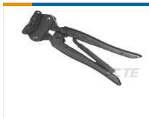
TE Part #91579-1 CCII ECON POWER REC 20-16 ASSY