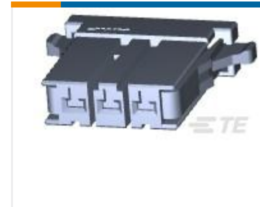
TE Part #3-178128-3 DYNAMIC D3200 REC HSG 3P SGL Z