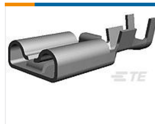
TE Part #175023-1 PL 250 RECEPTACLE 18-14 AWG PTBR