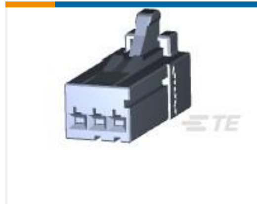
TE Part #2-1318120-3 DYNAMIC D2100 REC HSG 3P SGL Y