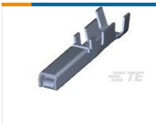
TE Part #353715-2 DYNAMIC D-3 REC CONT. 3L AU 0.38