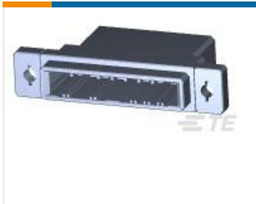
TE Part #1-178802-7 DYNAMIC3100S TAB HSG 8P PM X-K