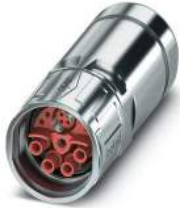
Spacer sleeve for M23 HYBRID cable connectors

Please be informed that the data shown in this PDF document is generated from our online catalog. Please find the complete data in the user documentation. Our general terms of use for downloads are valid.