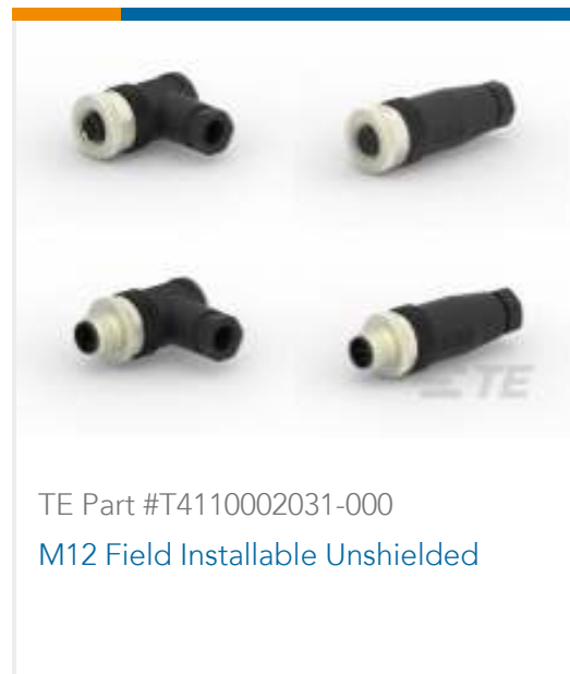
TE Part #T4110002031-000 M12 Field Installable Unshielded