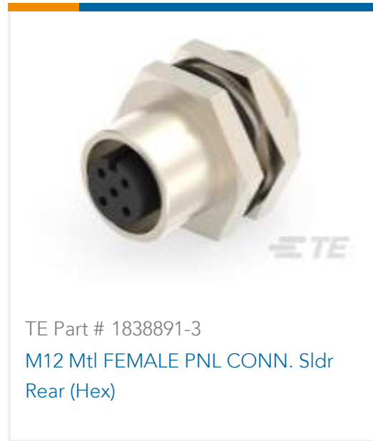
TE Part # 1838891-3 M12 Mtl FEMALE PNL CONN. Sldr Rear (Hex)