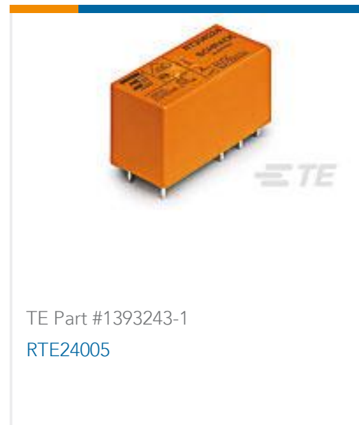
TE Part #1393243-1 RTE24005