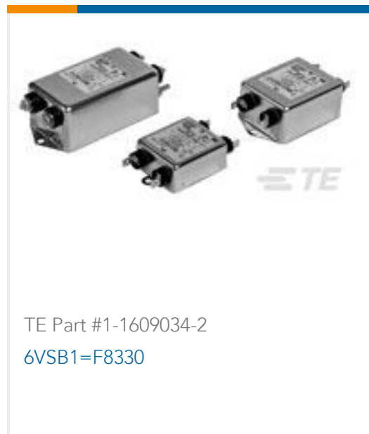
TE Part #1-1609034-2 6VSB1=F8330