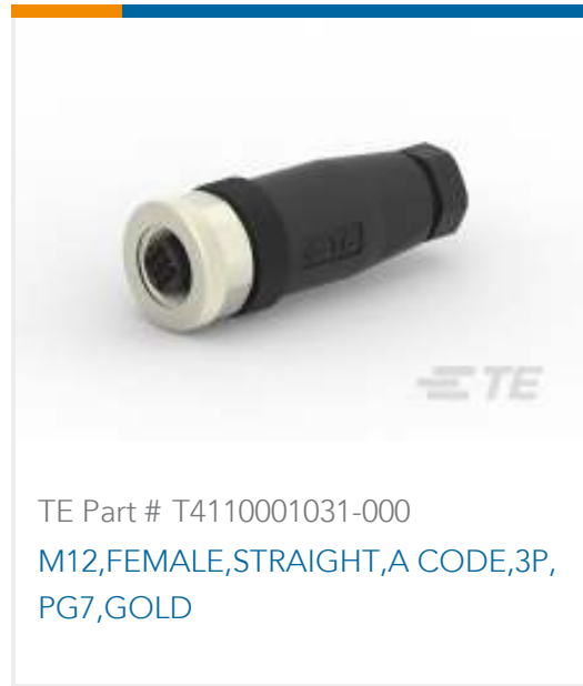
TE Part # T4110001031-000 M12, FEMALE, STRAIGHT, A CODE, 3P, PG7, GOLD