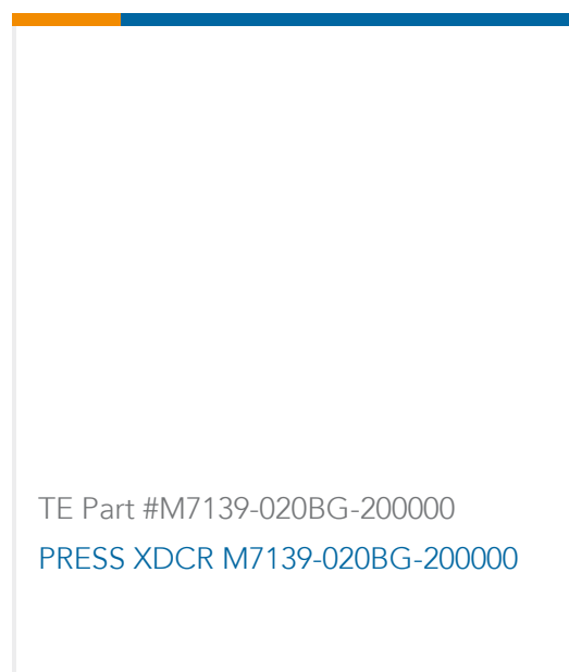
TE Part #M7139-020BG-200000 PRESS XDCR M7139-020BG-200000