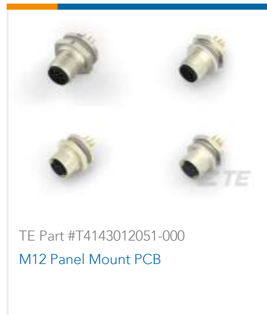
TE Part #T4143012051-000 M12 Panel Mount PCB