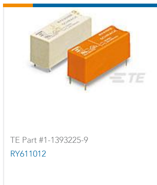
TE Part #1-1393225-9 RY611012