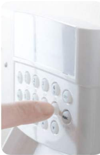
Smart Energy Home