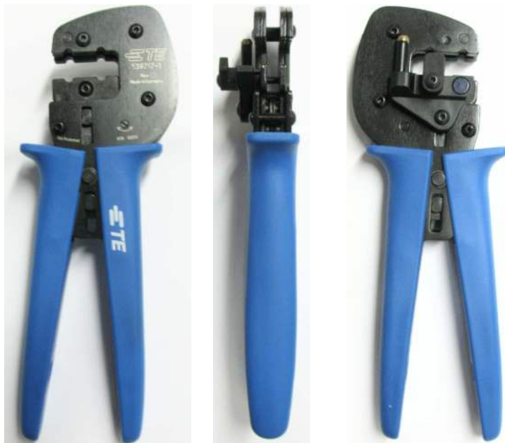
FRONT VIEW SIDE VIEW BACK VIEW