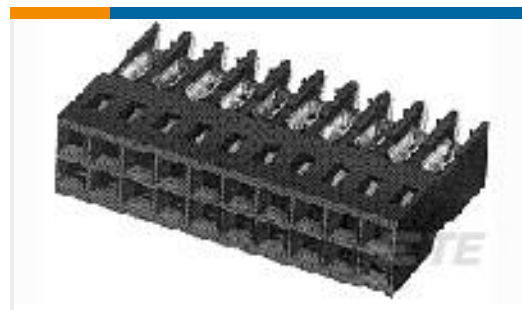
TE Part #102393-1 06 AMPMODU MT ASSY DR .100CL