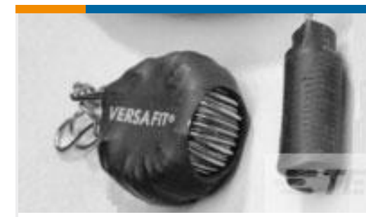
TE Part #505874K026 VERSAFIT-1/4-0-1IN