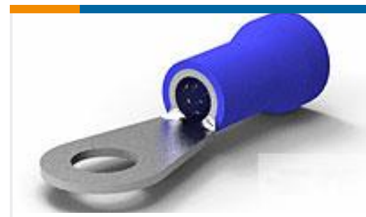
TE Part #52264-4 TERMINAL R PG 6 5/16