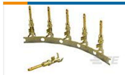
TE Part #1060-14-0144 PIN, SF, SIZE 16, 14-18, AU/SN