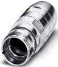
Sleeve housing for coupler connector, straight, Screw locking, M23, Shielded: Yes, Cable cross section: 10 mm...14 mm

Please be informed that the data shown in this PDF Document is generated from our Online Catalog. Please find the complete data in the user's documentation. Our General Terms of Use for Downloads are valid ( http://download.phoenixcontact.com )