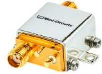
Generic photo used for illustration purposes only