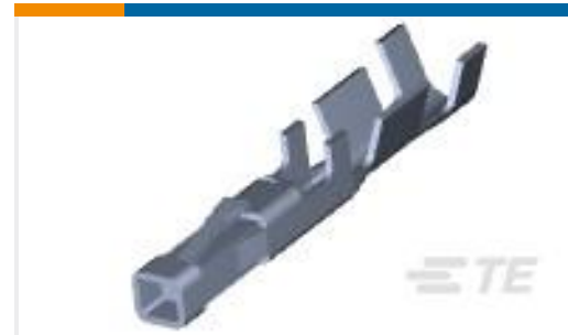
TE Part #794606-1 MICRO MNL RPT CNT STRIP 20-24