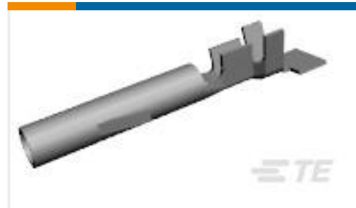
TE Part #770673-1 UMNL SOK 30-26 PTPBR L/P