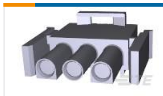
TE Part #1-350766-4 03P UMNL V0 PLUG HSG YELLOW