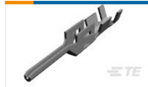
TE Part #1-794612-0 PIN CONT 20-24 TIN PLATE L/P