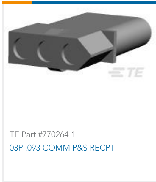
TE Part #770264-1 03P .093 COMM P&S RECPT