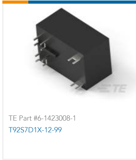
TE Part #6-1423008-1 T92S7D1X-12-99