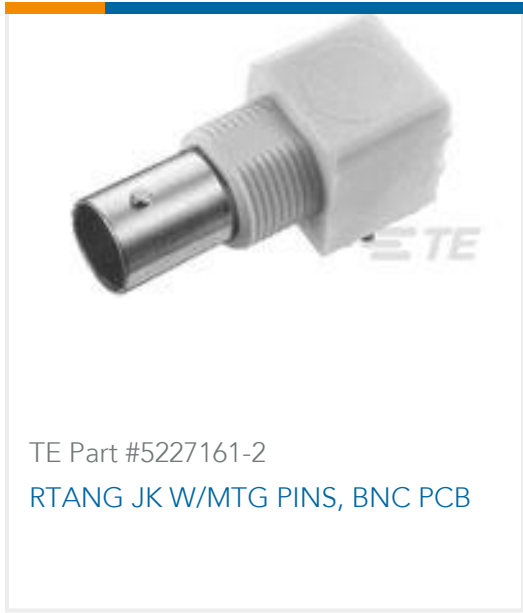
TE Part #5227161-2 RTANG JK W/MTG PINS, BNC PCB