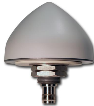
TW3370 / TW3372 Shown with Conical Radome. Low Profile Radome also available