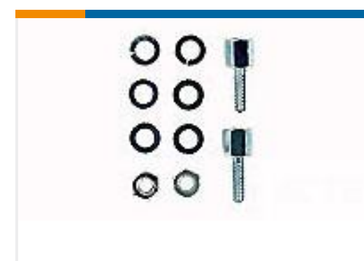
TE Part #215073-2 HD-20 VERRIEGLUNG