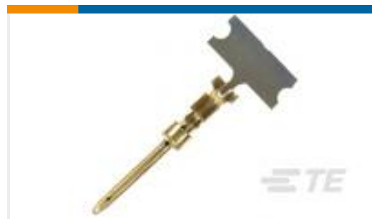
TE Part #1658539-1 PIN CONT DUPL PLT STRIP HD-20