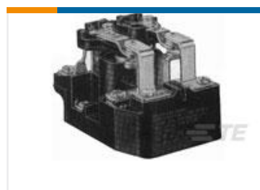
TE Part #8-1393127-0 PRD-3AY0-24=PRD