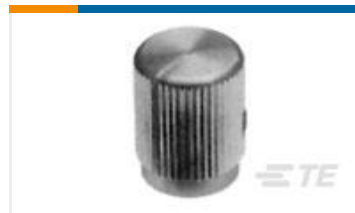
TE Part #1437622-7 KLN900B1/4=KNOB KNURL W/IND LI