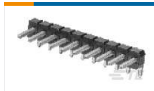
TE Part #5-826947-0 MOD2 PIN HEADER 50P