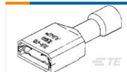
TE Part #3-520124-2 187 ULTRA-FAST ASY REC 16-14 AWG TPBR