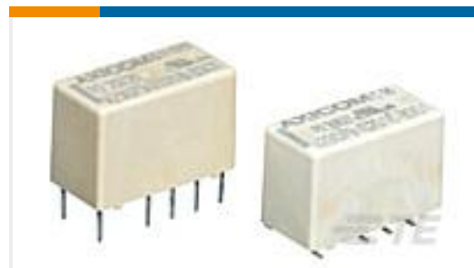
TE Part #5-1393788-5 V23079D1001B301