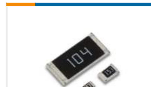
TE Part #1-2176337-7 CRGCQ 0402 220R 1%