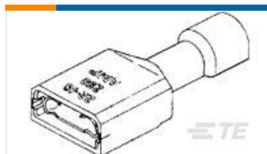
TE Part #3-520406-2 ULTRA-FAST 250 ASY REC 16-14 AWG TPBR