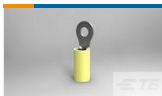
TE Part #2-35108-1 TERMINAL,PIDG R 12-10 8