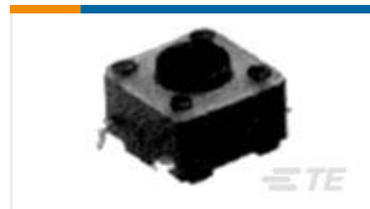
TE Part #2-1437565-7 FSM2JSMA=SMT,TACTILE,PB SWITCH