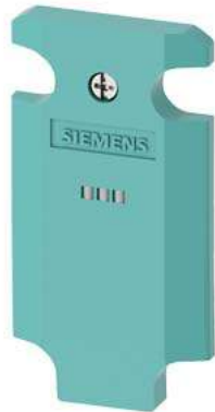
LED cover for position switch Metal 3SE51, with 2 LEDs, yellow/green, 230 V AC Color turquoise