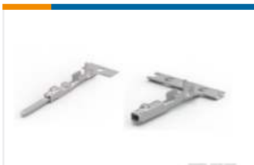
TE Part #1718760-3 MCON Receptacle and Tab