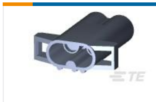
TE Part #151679 2 WAY M-N-L PIN HSG.NAT.