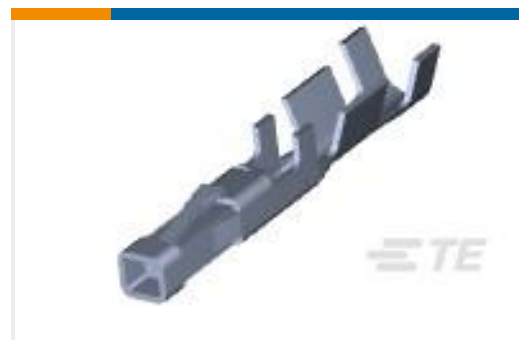
TE Part #1-794606-1 MICRO MNL RPT CNT STRP 15AU LF