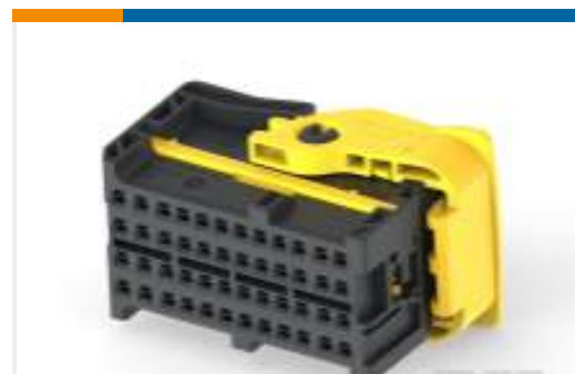
TE Part #2366036-1 48POS,MCON 1.2,REC HSG ASSY, UNSLD,COD A