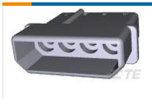
TE Part #1-480426-0 04P CMNL CAP HSG F/H NATL