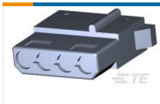
TE Part #1-480424-0 04P CMNL PLUG HSG F/H NATL